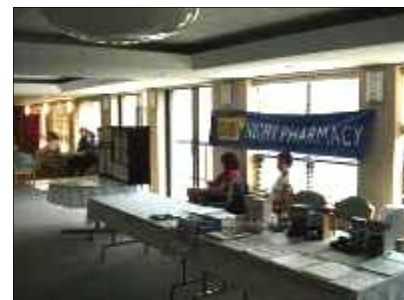
Day Night Pharmacy was on hand to answer questions.