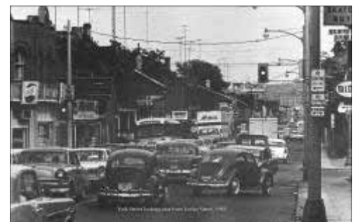
York Street looking east from Locke, 1965