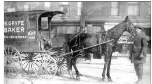
Gryfe Baker, 115 York Street, 1915