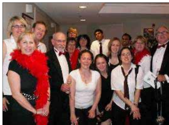
The Shalom Village volunteer team