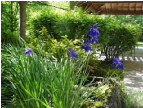
Our gardens are beautiful and accessible, even for those in wheelchairs

Below are a few snapshots of people having fun getting their hands dirty on June 1 st .