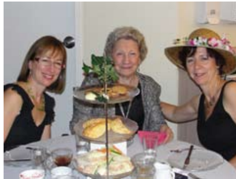
The only thing better than the food was the company