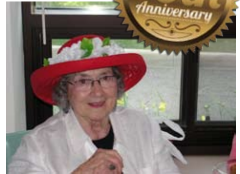
The Tea is a wonderful opportunity to show off your finest millinery