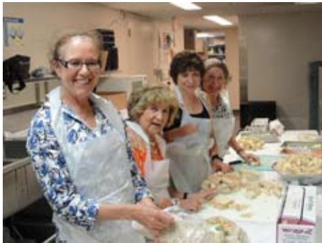
Volunteers hard at work in the kitchen preparing sandwiches