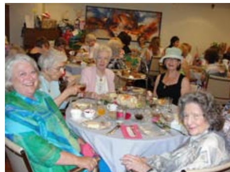
Where good friends meet

For ticket information, or to learn more about sponsorship opportunities, call Kathleen Thomas at (905) 529-1613 ext. 264 or email kathleen@shalomvillage.ca