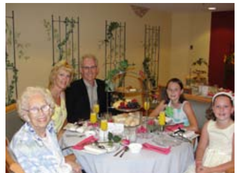
The Tea is a multi-generational event enjoyed by all ages